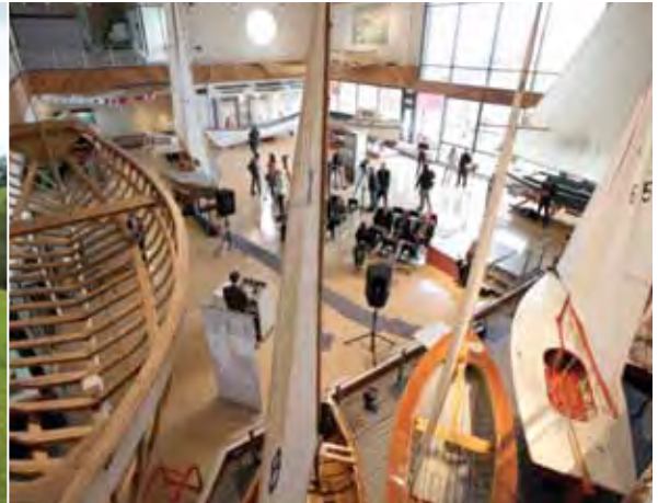
Summer Institute 2013, Halifax. Participants visiting the Maritime Museum of the Atlantic.

We also created a variety of successful workshop models (see Highlights 2013). As our catalogue of print and on-line teacher resources expanded, we were able to deliver more efficient and more effective workshops.